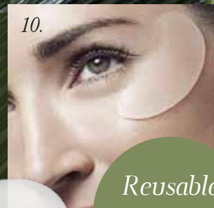
Reusable Silicone Masks